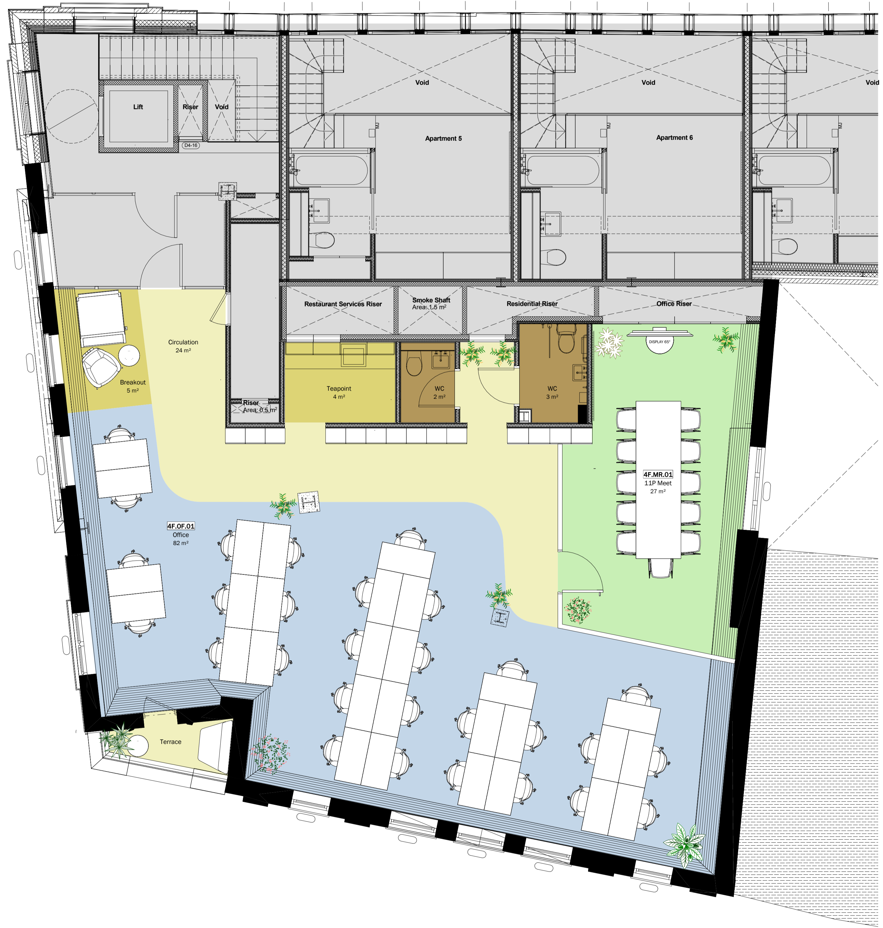
1 Level 04 - Max Cap 1 : 50

These drawings are for design intent only and should not be used for construction purposes.