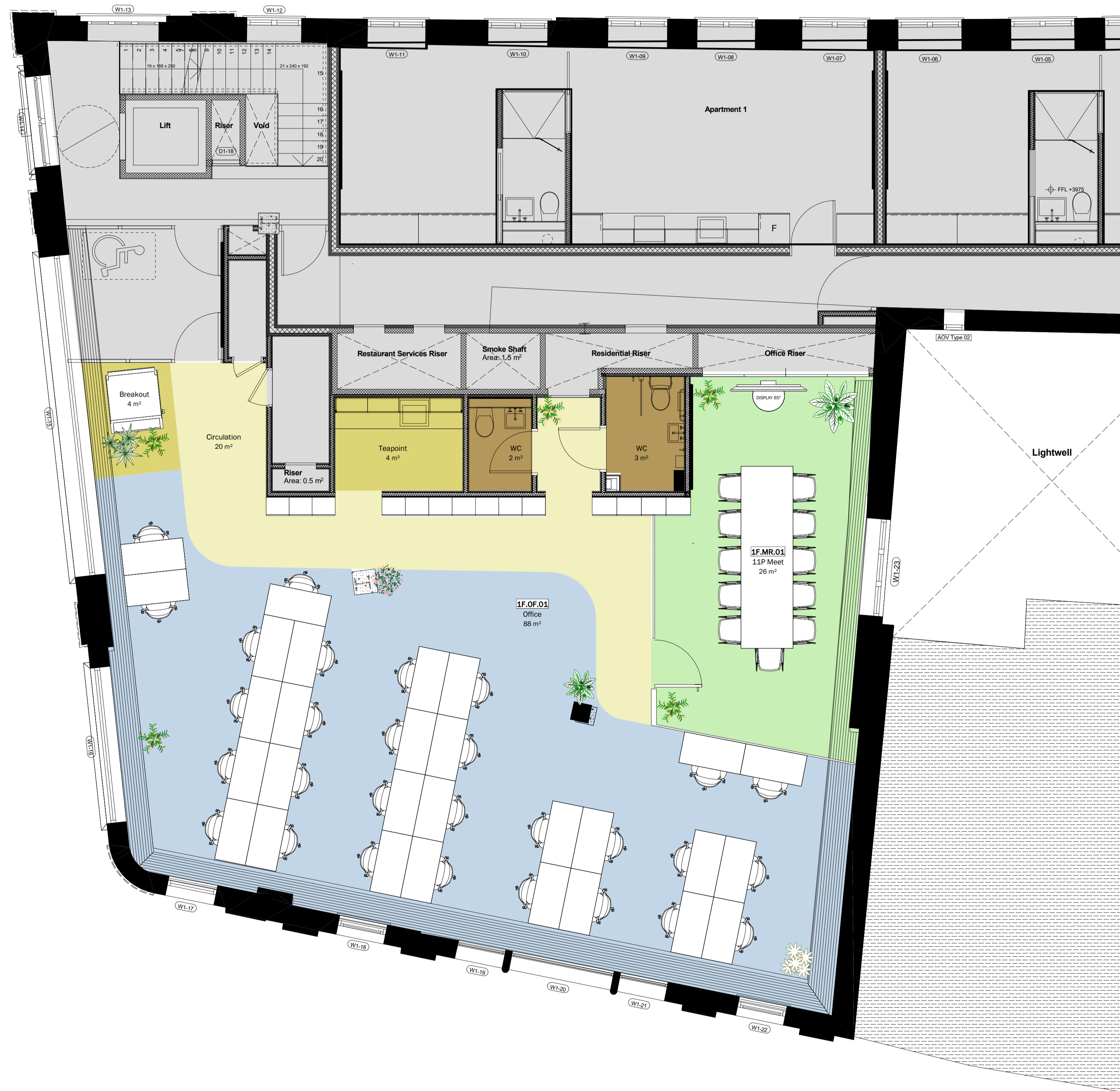
1 Level 01 - Max Cap 1 : 50

These drawings are for design intent only and should not be used for construction purposes.